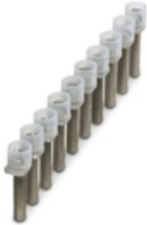
Jumper, pitch: 10 mm, number of positions: 10, color: silver

Please be informed that the data shown in this PDF Document is generated from our Online Catalog. Please find the complete data in the user's documentation. Our General Terms of Use for Downloads are valid ( http://phoenixcontact.com/download )